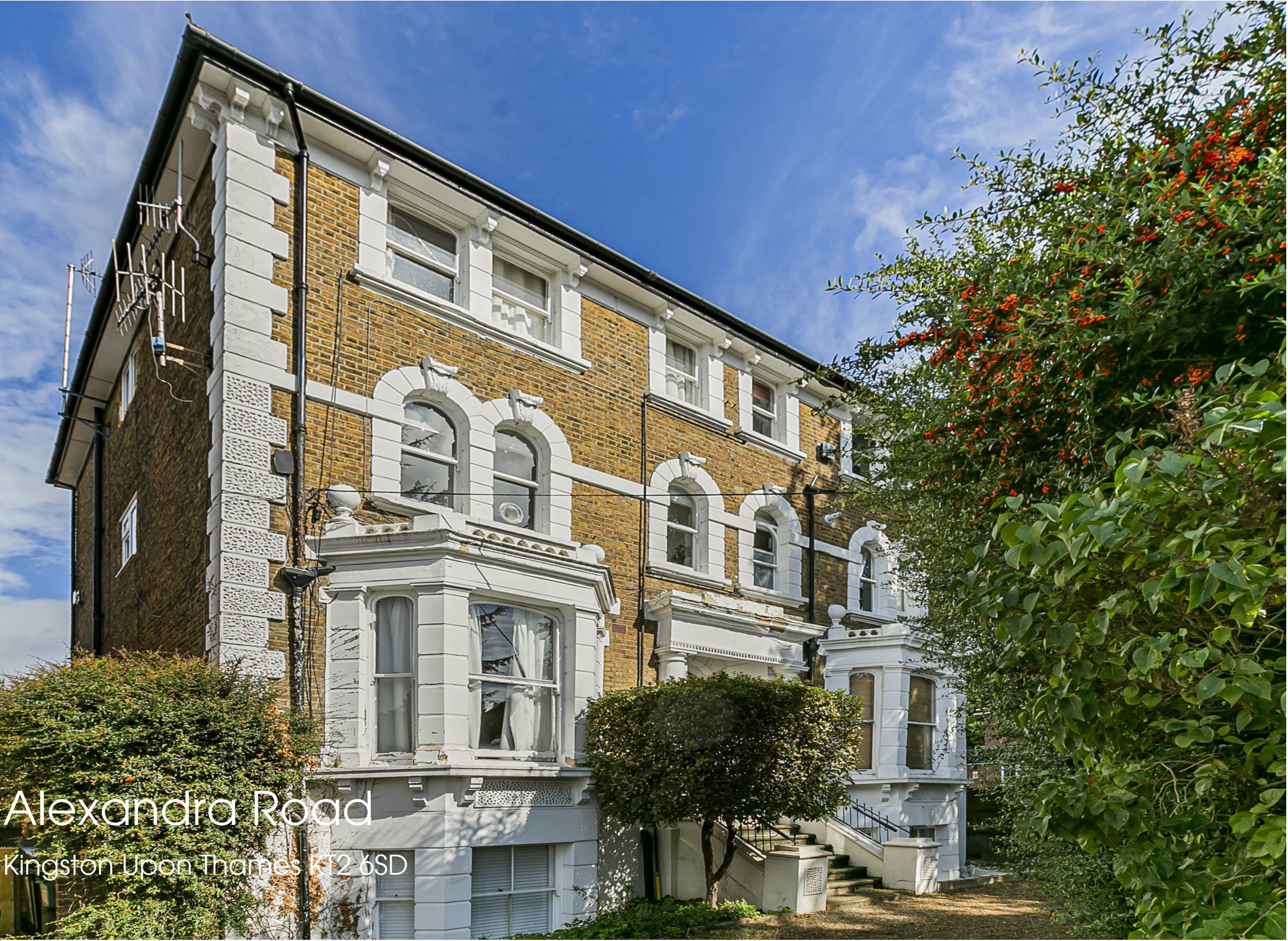
Alexandra Road Kingston upon Thames KT2 6SD